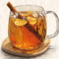
APPLE CINNAMON BLACK RESERVE 4.0 5.5