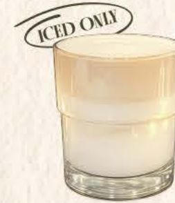
BUTTERCREAM RESERVE LATTE 5.0 6.5