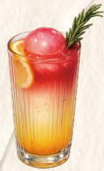
PEACH MANGO SPARKLING 7.5 9.0