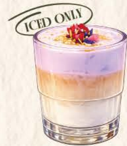
LAVENDER VELVET LATTE 5.0 6.5