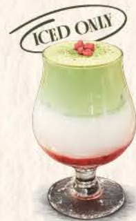
STRAWBERRY MATCHA BLEND 5.0 6.5