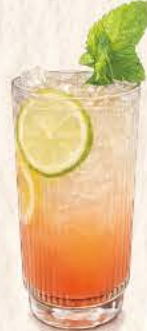
GRAPEFRUIT LEMONADE 6.5 8.0