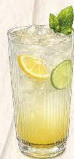
GREEN PLUM SPARKLER 6.5 8.0