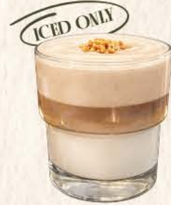
PEANUT CLOUD LATTE 5.0 6.5