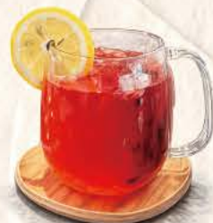
CITRON HIBISCUS INFUSION 4.0 5.5