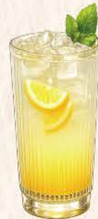
HONEY CITRON LEMONADE 6.5 8.0