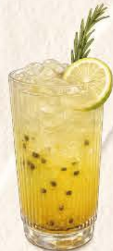
PASSIONFRUIT SPARKLING 6.5 8.0