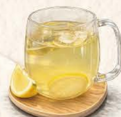
LEMON GINGER GREEN BREW 4.0 5.5