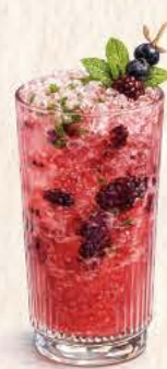
BERRY BLOOM 7.5 9.0