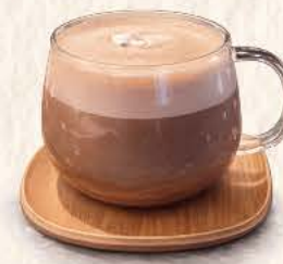
SIGNATURE CACAO 5.0 6.5