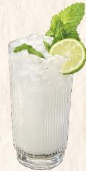
COCONUT MOJITO 7.5 9.0